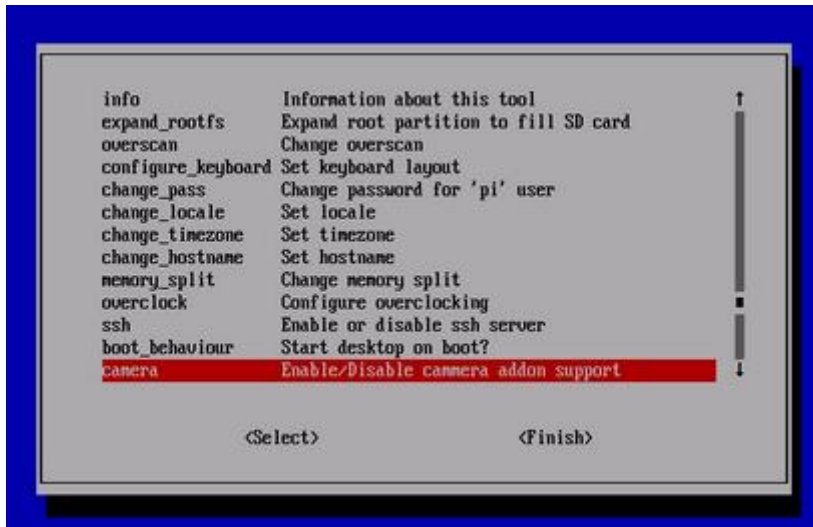
Figure 2: Enable camera