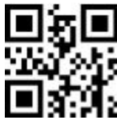
Same barcode reading delay

The same barcode reading delay refers to that after the module reads the same bar code, it will be compared with the last reading time,when the interval is longer than the reading delay, the same barcode is allowed to be read, otherwise the output is not allowed.