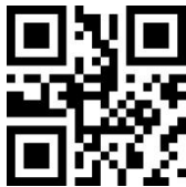
Cancel the previous read a string of data